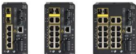
Figure 1. IE-3100 Rugged Series switches models