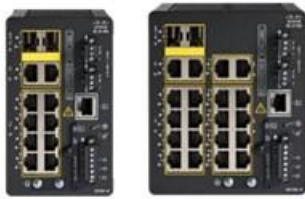
Figure 2. IE-3105 Rugged Series switch models with enhanced feature set