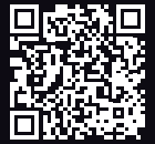
RUT271 360° VIEW